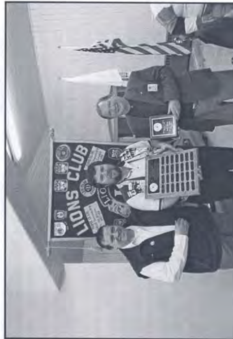
Frank Freier Award - BAIT Volunteer of the Year 2003