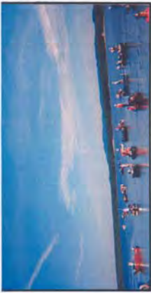
Ready & Waiting