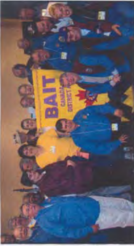
B.A.I.T. COMMITTEE 2002-2004