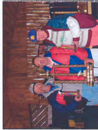
Prizes and awards