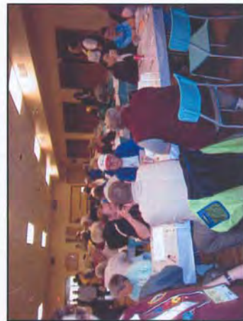
Red Carpet Dinner