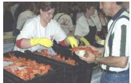
A Volunteer Serving Lobster

Be aware though: this type of event is not for the "weak-of-heart". It took over 100 Lions, Lion's families and friends, and student volunteers to pull it off. And the lobster we served cost $32,000 !!